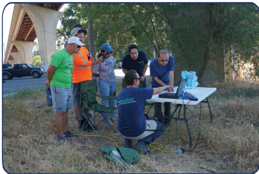
AutoNav Plus™ Onshore computer setup

The AutoNav Plus™ combines the AutoNav™ control system, which enables USVs to navigate pre-programmed survey routes, with a long range communication control system and built-in computer for data logging and control of 3rd party applications. The system was designed to log GPS and echosounder data locally on the USV's onboard computer, utilizing hydrographic survey software or other Windows-based data collection software. Real-time monitoring and data acquisition can be viewed from the onshore computer, streamlining survey missions in challenging waters.