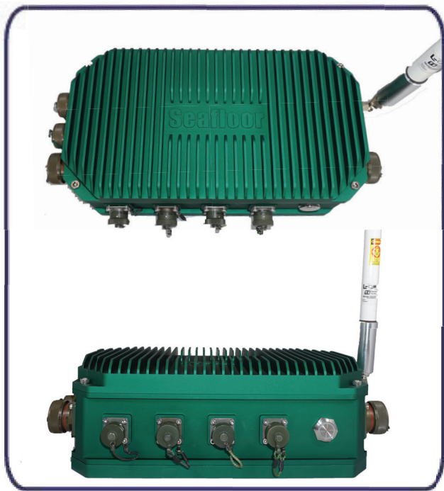
AutoNav Plus™ system fits small to large USVs