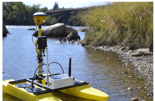
Unit can be integrated into remote / autonomous survey vessels

Seafloor Systems, Incorporated | 4415 Commodity Way | Shingle Springs, CA 95682 | USA