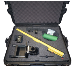
Rugged Shipping Case