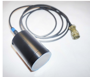
Single Frequency Echosounder Units