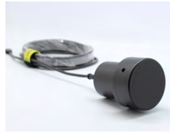
Dual Frequency Echosounder Unit