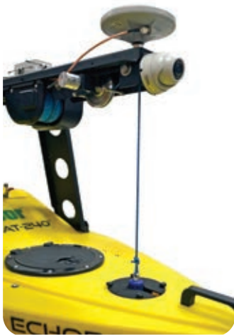
Winch comes spooled with 30m of rope

The SmartCast™ was designed to automatically deploy a sound velocity profiler to user-selected depths. The winch can be mounted onto the front of the USV and uses an IP69k encoder to track the SVP. The user can arm the system, toggle between RC and auto, change units, enter the desired cast depth, and monitor cast activity all within the integrated Seafloor SmartCast software. Using the integrated limit switch, the home position is reset before every cast to ensure accurate casts. The system can also sense if the SVP has hit bottom, and will return to home when detected.