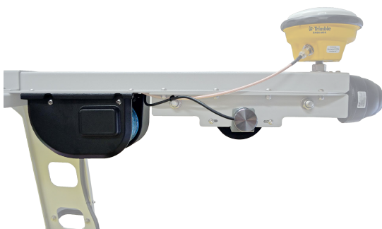
Fully- Integrated Design