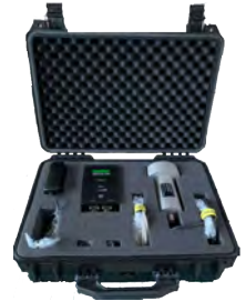
Rugged Shipping Case