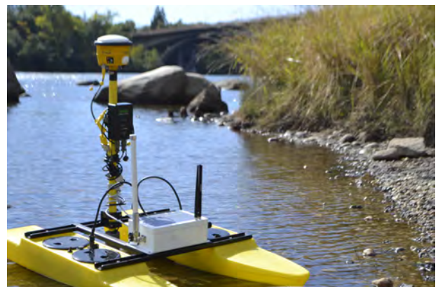
Unit can be integrated into remote / autonomous survey vessels

Seafloor Systems, Incorporated | 4415 Commodity Way | Shingle Springs, CA 95682 | USA