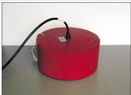
Fig. above: The 12 KHz transducer

The new state of the art high-frequency, high power sub-bottom profiler from General Acoustics, the SUBPRO 1210, with its advanced sending signal synthesis, high performance data acquisition, with high dynamic range and SNR and advanced signal processing is a universal survey system with outstanding advantages for a wide range of applications with different survey tasks.