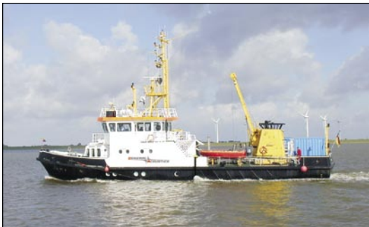
Fig. above: Example of Survey Ship