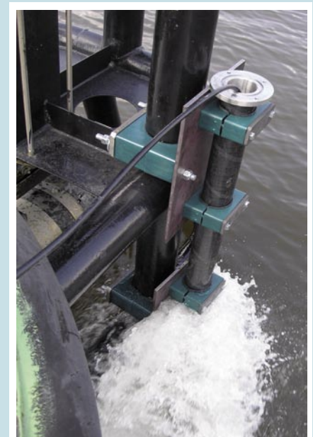
Fig. above: Example, mounting of the transducer at a tube